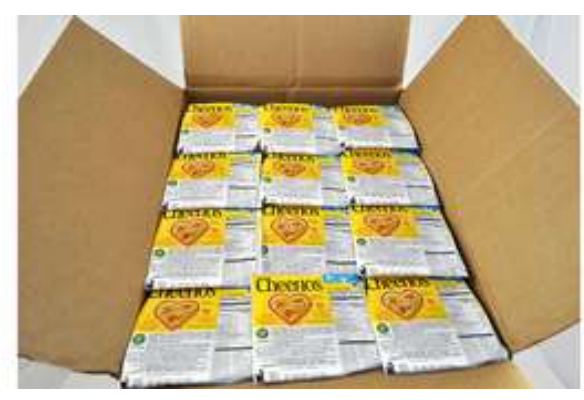
Case / box inside view