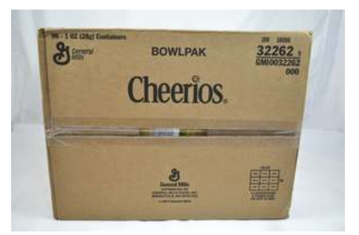
Case / box top