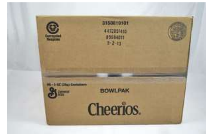
Case / box bottom