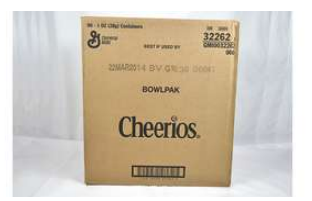
Case / box wide front side 1